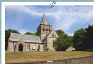
All Saints church at East Meon

Runs on Sundays* from 23 July to 24 Sept 2023