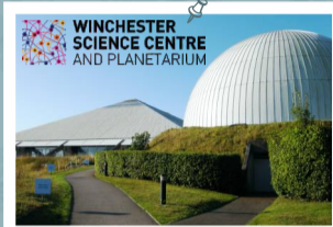
Winchester Science Centre

For HCRP information contact mark@hampshirecommunityrail.co.uk