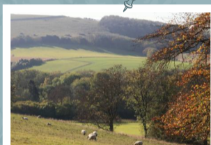
Old Winchester Hill