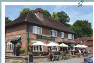
"The Shoe" at Exton